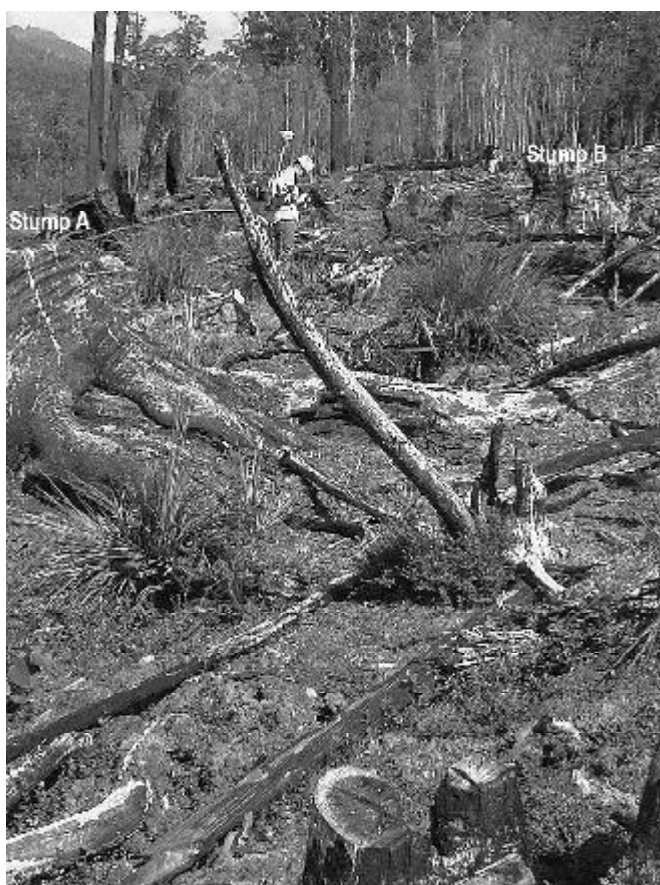
Photo 1. Long-term chemistry Plot P, looking from the eastern corner towards the starting point at the southern corner. Note stumps A and B shown in the layout of the plot. Such photographs and maps should enable these plots to be accurately relocated in the distant future.

Analysis of variance between pre-harvest and post-burn results was conducted by using Genstat 5 Release 3.2. Percentage concentrations were converted to kilograms per hectare by using the mean bulk density for the individual plots (pre-harvest) and individual subplots (post-burn) and allowing for the depth of samples.