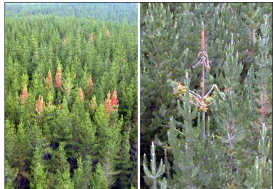
Fig. 3: Ringbarked tops by browsing possums

Aerial surveys may be carried out in a high-winged plane such as a Cessna 172, 182 or 206. When we first started conducting aerial surveys we used Cessna's, however due to the difficulty of finding and retaining a good pilot we decided that helicopters better suited our requirements. The two types of helicopters we use are Jet Rangers and a Robinson 44, and the sketchmapper and navigator sit on the same side so that they have a similar view. Helicopters allow a much clearer view of the plantations, and the ability to hover above a sick tree for accurate GPS fixing of problems that require follow-up assessment on the ground is extremely useful. This feature has also enabled us to hover close enough to pine trees to observe the bark stripped off by possums, which often ringbark the stems causing the tops to die.