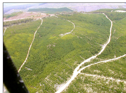
Fig. 4: Patches of nitrogen deficiency

The optimum flying altitude for aerial sketchmap surveys is usually 1,000 to 2,500 feet above ground level (AGL). The surveys are flown as high as possible while still allowing the observer to accurately identify nutrient deficiency and pest-caused damage. This also improves efficiency and productivity since the area in view is greater at higher altitudes; hence more area can be covered in less time. Higher altitudes also improve the observer's ability to navigate and track his/her location as well as determine the relative location, extent, and severity of the pest damage. Survey flights are not usually conducted below 1000 feet AGL.