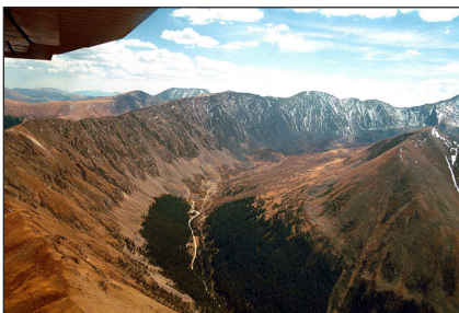
Fig. 7: Aerial survey in the Rocky Mountains, Colorado

Aerial photography is used where phenomena such as patch death, severe defoliation or crown dieback are detected in older plantations. Photographs can also be used as an aid by the sketchmapper to assess the general health status of younger plantations and help detect and delineate any patches of differing performance within compartments. To further my experience in aerial sketchmapping