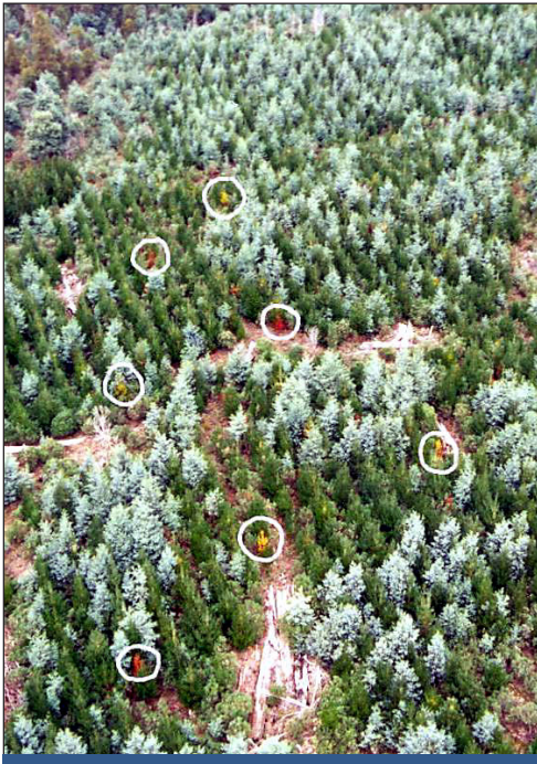
Fig.5: Young pine trees in various stages of mortality due to ringbarking