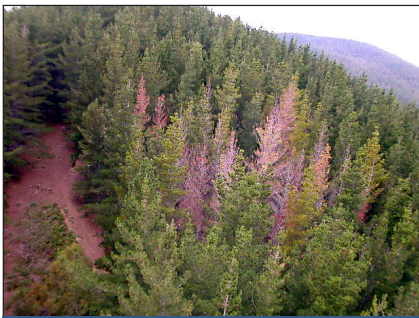
Fig 6: Mortality due to fire