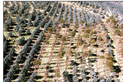
Fig.8: Eucalypt mortality caused by Endothia gyrosa (northern Tas)

There have been a few success stories to justify aerial surveys in Tasmania. During this summer whilst conducting surveys in southern Tasmania, a couple of dead trees were observed in a eucalypt plantation of approximately 10 years of age. Waypoints were obtained for the dead trees and then a follow-up survey was conducted. It turned out that up to 50% of the trees were infected with the fungal disease Endothia gyrosa , which eventually kills the trees. This early detection will enable the timber to be salvaged before any more of the trees die.